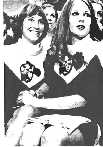
Red Devil yell leaders watch a gymnast routine holding hands to contain the excitement at state meet which devastated Saturday.