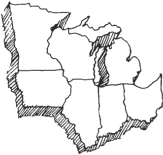
Region 4 - Illinois, Indiana, Michigan, Ohio, Minnesota, Wisconsin, Iowa.